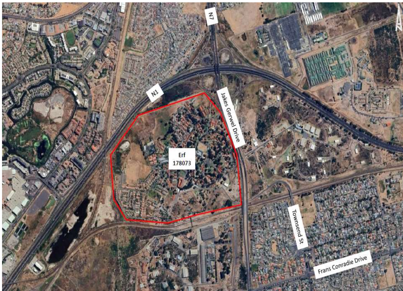
FIGURE 1: ACACIA PARK PROJECT: PRECINCT PLAN DEVELOPED IN 2013